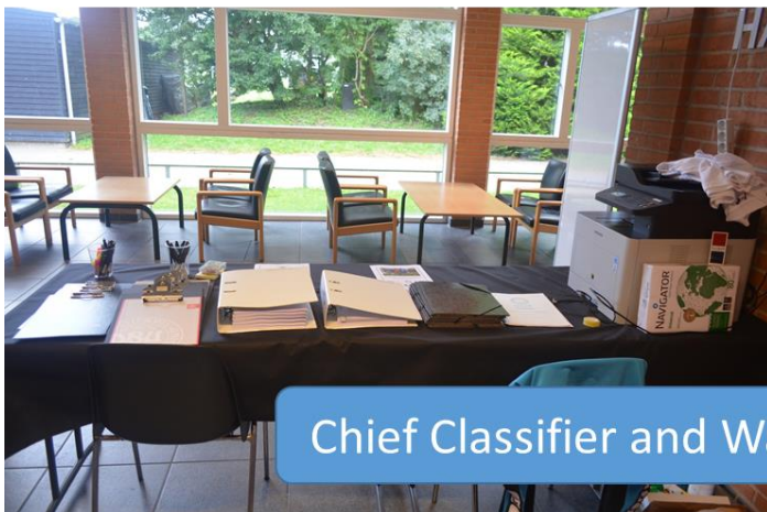
Chief Classifier and Waiting Area